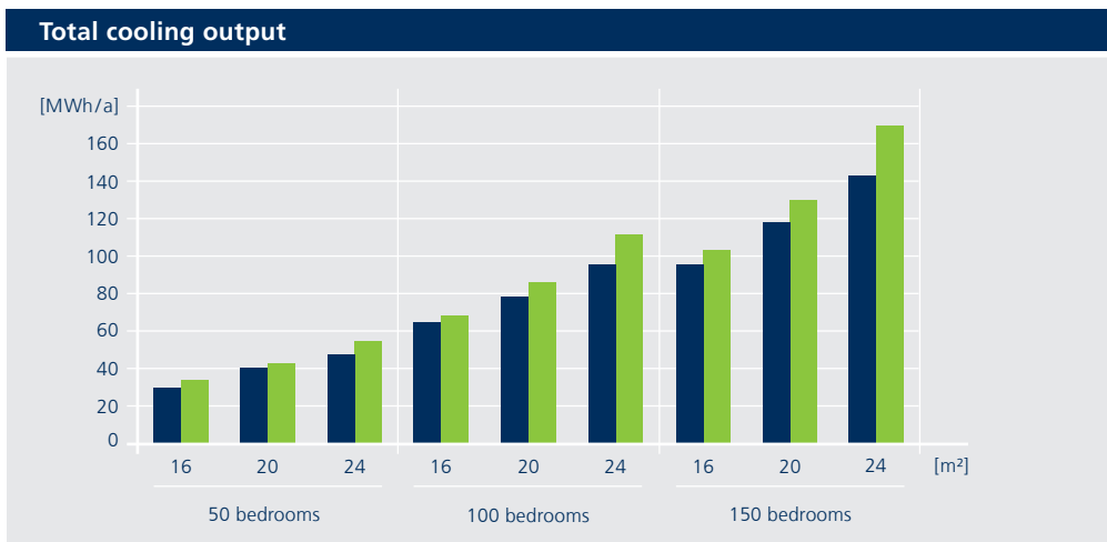
Fig. Comparison of the cooling energy requirement based on the total of the hourly cooling loads multiplied in each case by 20 hours and the number of bedrooms.

The result of the electrical energy requirement in the air handling unit is reflected in the cooling energy requirement. It was assumed that the primary air enters the room pre-conditioned. Greater cooling output from the air handling unit is fed to induction units owing to the increased air volume, regardless of whether the cooling output is actually needed. It is also possible that the outside air is cooled in the centralised ventilation unit and has to be re-heated in the room to the customer's requirement.