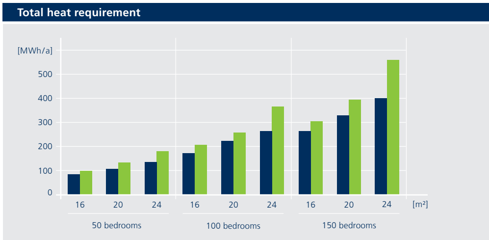
Fig. Comparison of the heating energy requirement based on the total of the hourly heat load multiplied in each case by one hour and the number of bedrooms.

It is not possible to use the recirculating air in a mixing chamber in the centralised ventilation unit, as the extract air from the bathrooms may not re-enter the supply air on account of the odours produced there.